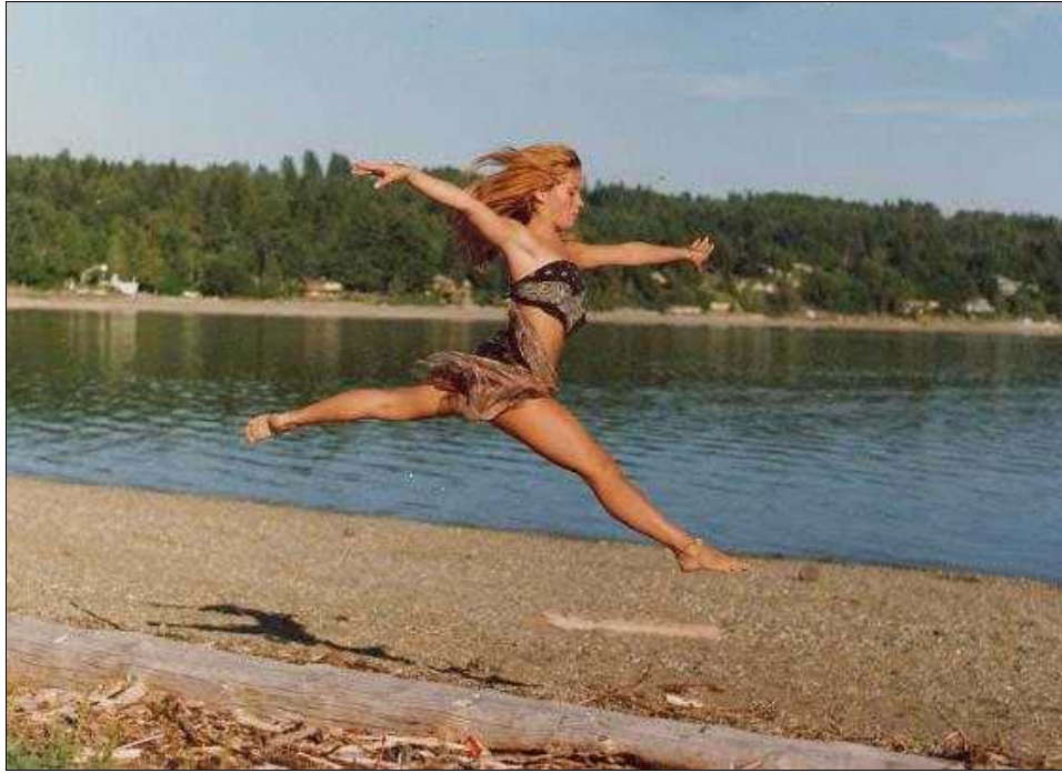
Before Brain Tumor